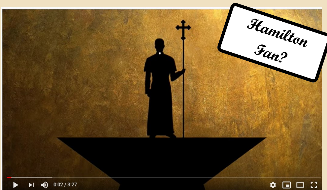
“You’ll Be Back” - a church parody

A bit of silliness captured in a U-Tube video presented by our Episcopal friends.